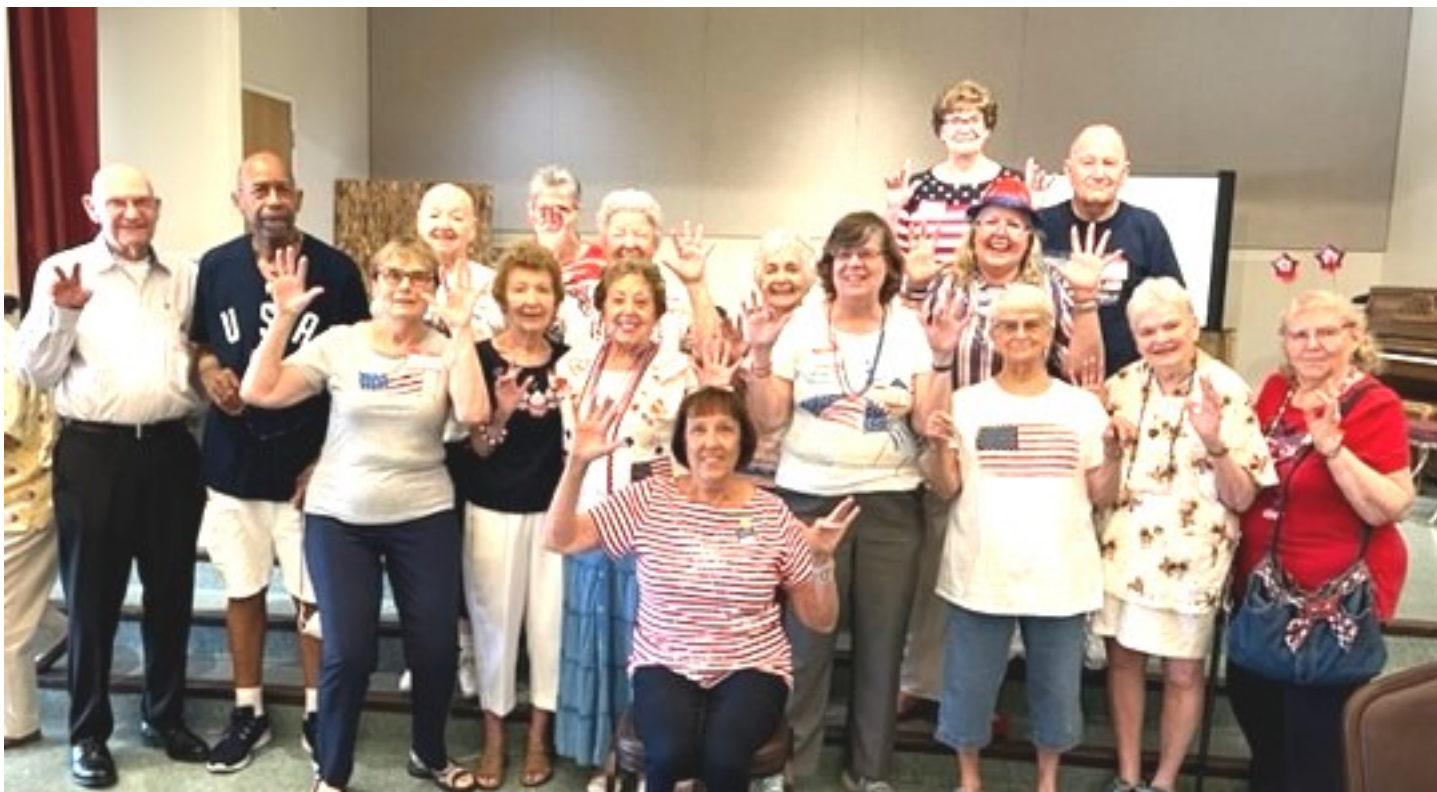
Members who attended the July 2 general meeting in their patriotic attire.